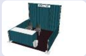
Pipe and Drape Furniture Package